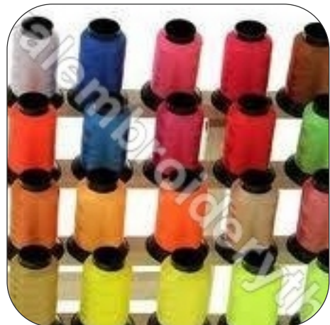
Viscose Rayon Embroidery Yarn (Cone)