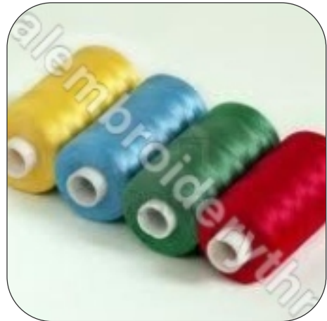
Viscose Rayon Dyed Yarn