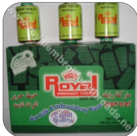
Viscose Rayon Embroidery Yarn 150 D