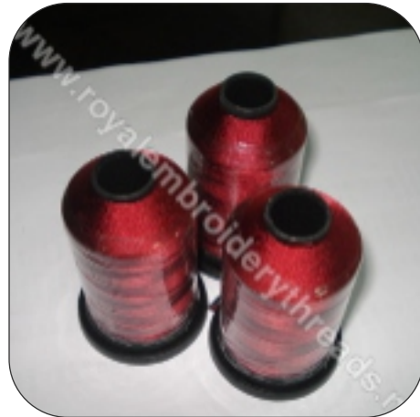
Viscose Rayon Embroidery Yarn Y-Cone