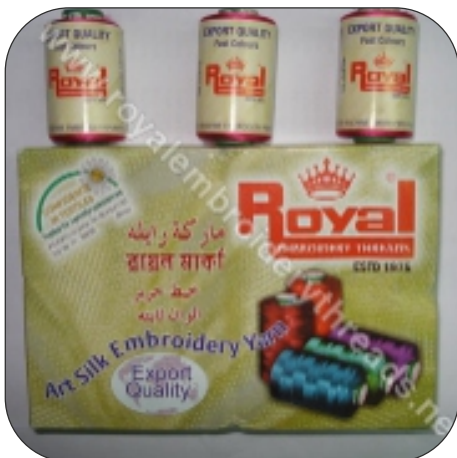
Viscose Rayon Embroidery Yarn (Tube)