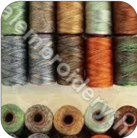
Viscose Embroidery Yarn