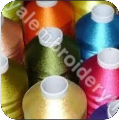
Viscose Embroidery Yarn Cone