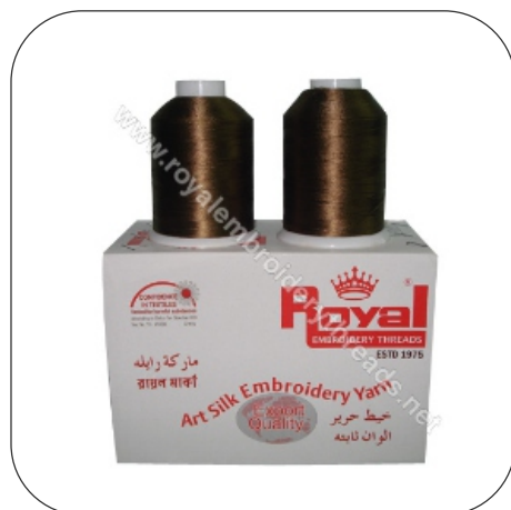
Viscose Rayon Embroidery Yarn (Jumbo)