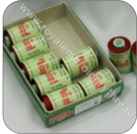
Paper Tube Viscose Rayon Embroidery Yarn