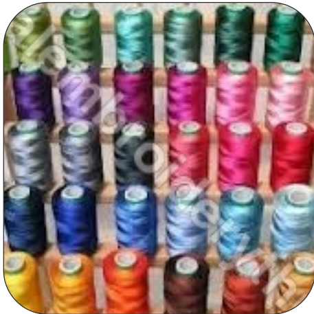
Viscose Rayon Embroidery Yarn