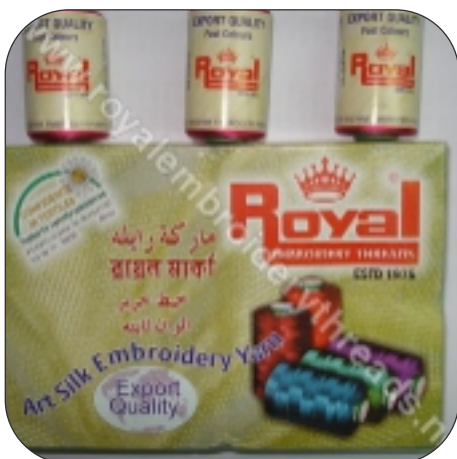
Viscose Rayon Embroidery Yarn 100 D