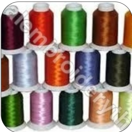
Viscose Rayon Embroidery Yarn (Y-Cone)